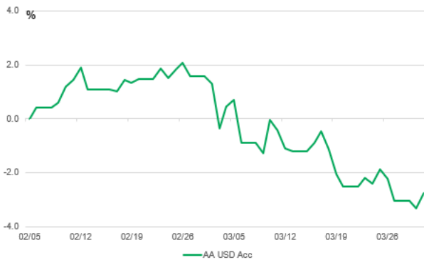
The Fund's NAV performance since inception

The Fund's performance is a direct result of its unique structure, which provides consistent, reliable income while offering potential upside through equities. Indeed, as different asset classes outperform at different points in the market cycle, a multi-pillar approach can serve as a source of strength in volatile markets (see Chart 2).