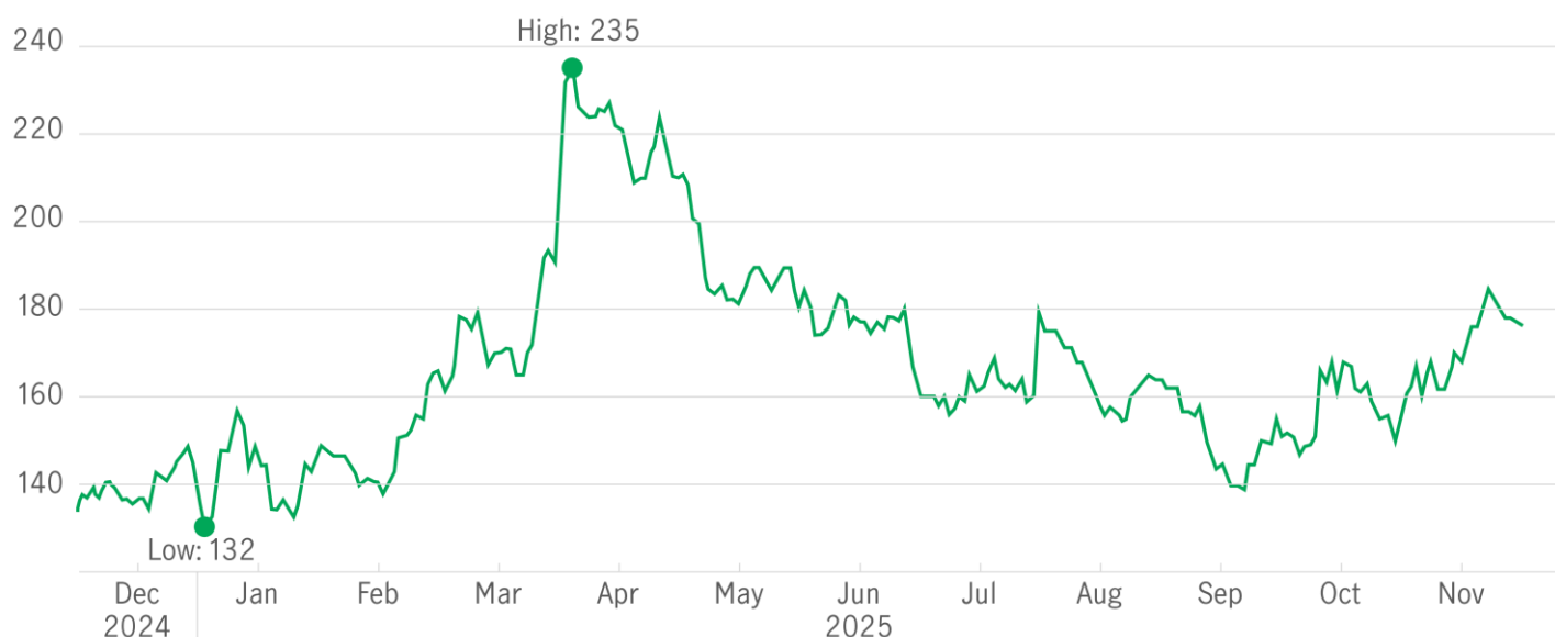
Chart 3: Potential tightening of preferred credit spreads (basis points)

The above chart shows the credit spread of ICE BofA US All Capital Securities Index. For illustrative purposes only.