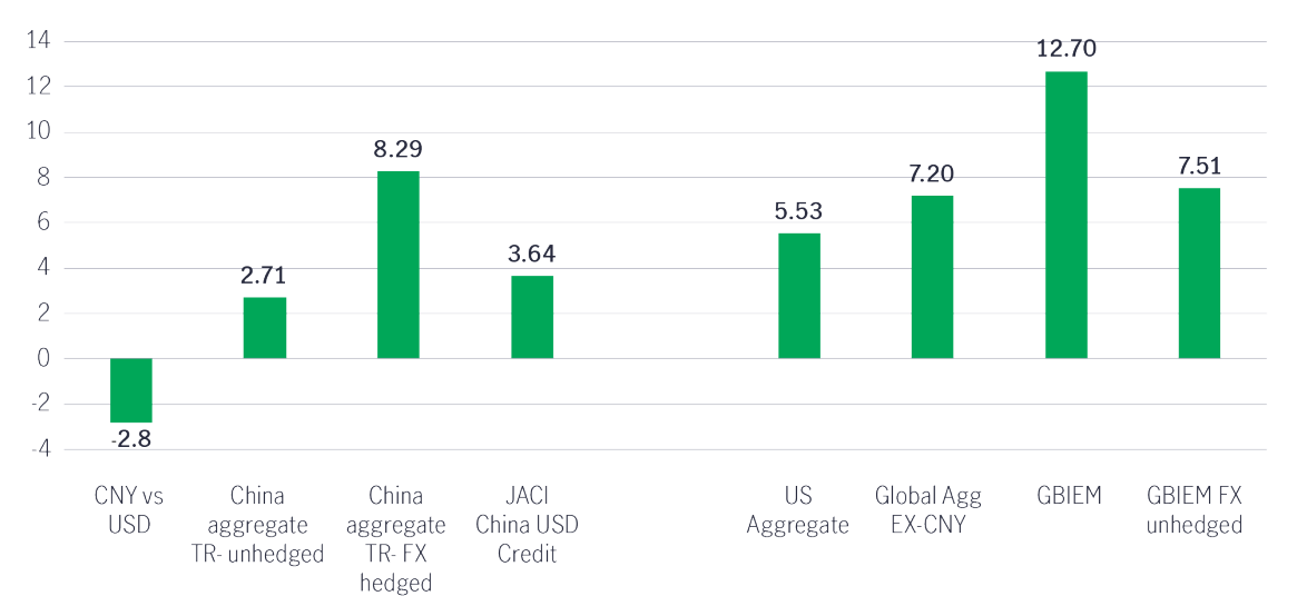
Chart 1: 2023 market recap – returns in USD

It is not possible to invest directly in an index. Past performance does not guarantee future results. China aggregate TR-unhedged refers to Bloomberg Global Aggregate China TR Index Unhedged, China aggregate TR-FX hedged refers to Bloomberg Global Aggregate China TR Index Hedged, JACI China USD Credit refers to J.P. Morgan China Total Return, US Aggregate refers to Bloomberg US Aggregate Total Return Value Unhedged, Global Agg EX-CNY refers to Bloomberg Global Aggregate Ex-CNY, GBIEM refers to JPMorgan Government Bond Index-Emerging Markets, and GBIEM FX unhedged refers to JPMorgan Government Bond Index-Emerging Markets Unhedged.