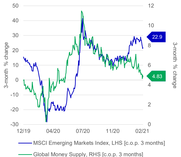
Chart 1: Global money supply versus MSCI EM Index 2

Chart 1 shows the three-month growth in global liquidity (green line) against the three-month change in MSCI EM equities. In our view, the chart has been flashing a warning sign in that EM equities had